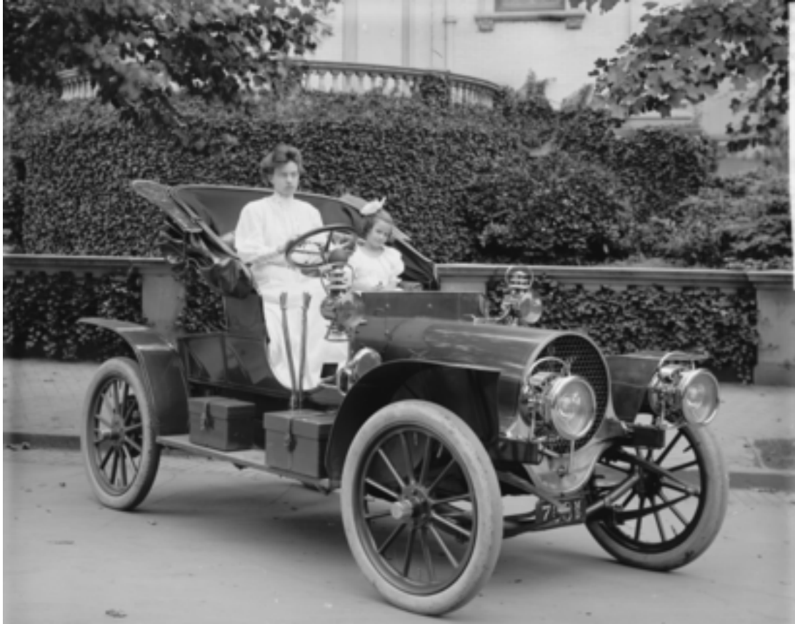
Figure 1: 1907 Franklin Model D roadster.

example, however we only output the series if the volume number is given [8] (so series should not be present since it has no vol. no.), a chapter in a divisible book [9], a chapter in a divisible book in a series [10], a multi-volume work as book [11], an article in a proceedings (of a conference, symposium, workshop for example) (paginated proceedings article) [12], a proceedings article with all possible elements [13], an example of an enumerated proceedings article [14], an informally published work [15], a doctoral dissertation [16], a master's thesis: [17], an online document / world wide web resource [18, 19, 20], a video game (Case 1) [21] and (Case 2) [22] and [23] and (Case 3) a patent [24], work accepted for publication [25], prolific author [26] and [27]. Other cites might contain 'duplicate' DOI and URLs (some SIAM articles) [28]. Multi-volume works as books [29] and [30]. A couple of citations with DOIs: [31, 28]. Online citations: [32, 18, 33, 34].